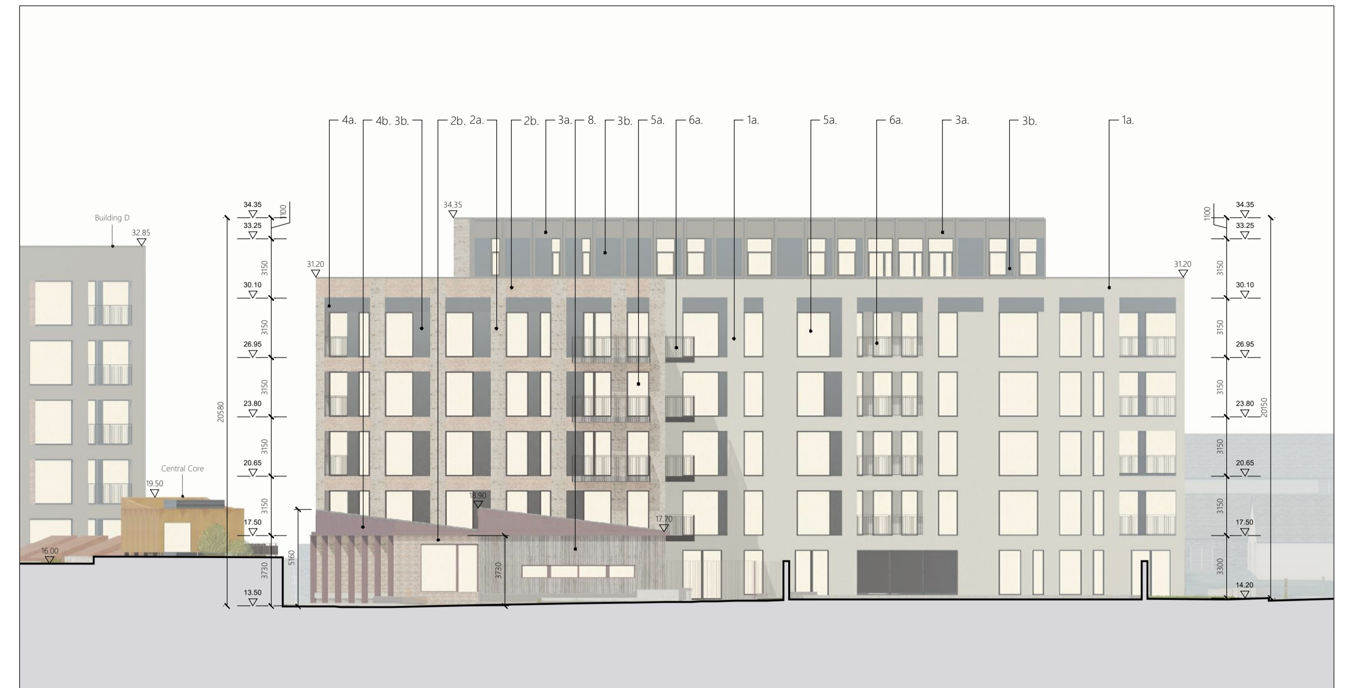
2 BUILDING A: EAST ELEVATION A2 SCALE 1:200