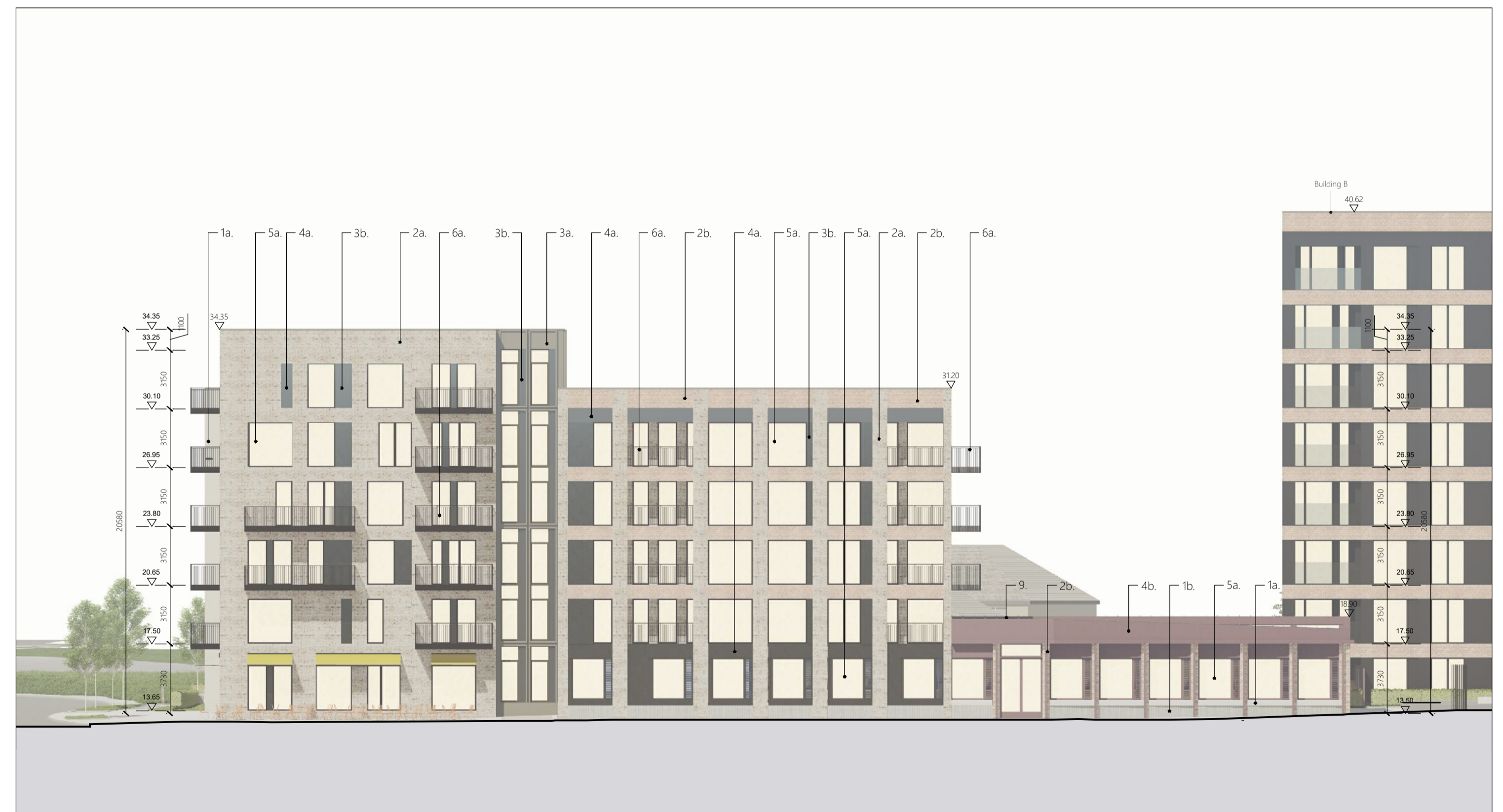
4 BUILDING A: SOUTH ELEVATION A4 SCALE 1:200