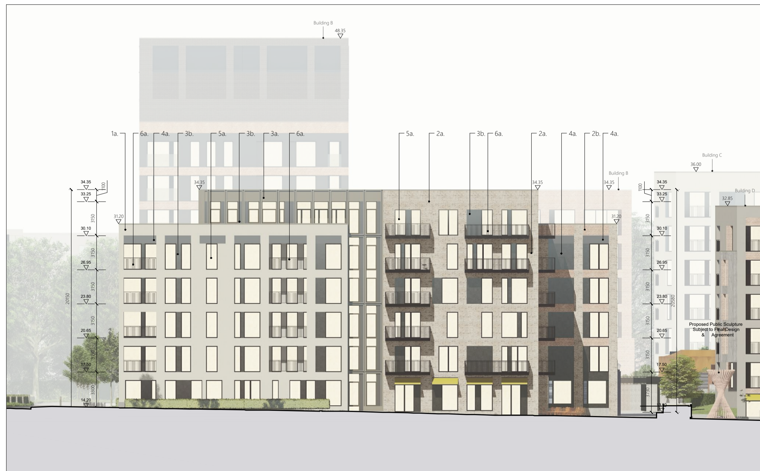
3 BUILDING A: WEST ELEVATION A3 SCALE 1:200