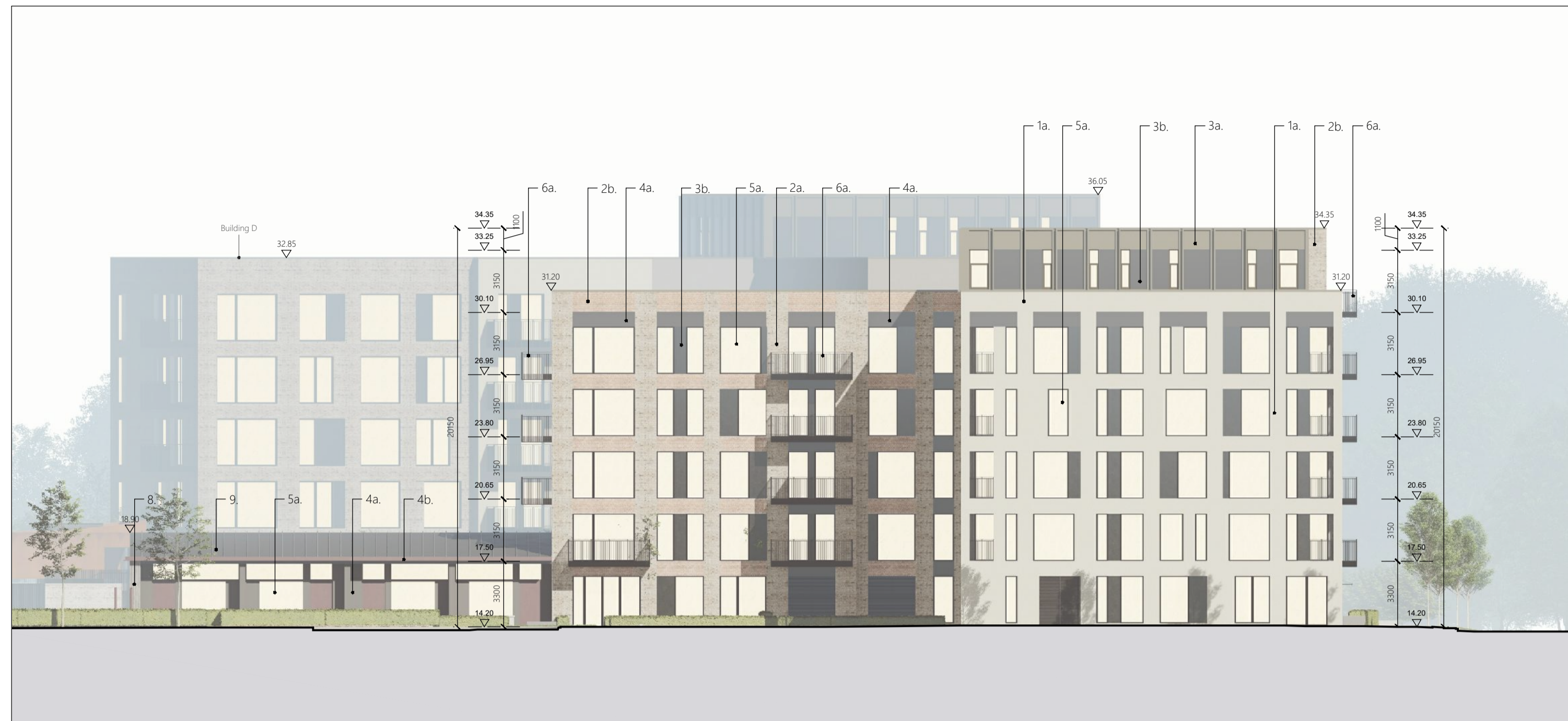
1 BUILDING A: NORTH ELEVATION A1 SCALE 1:200